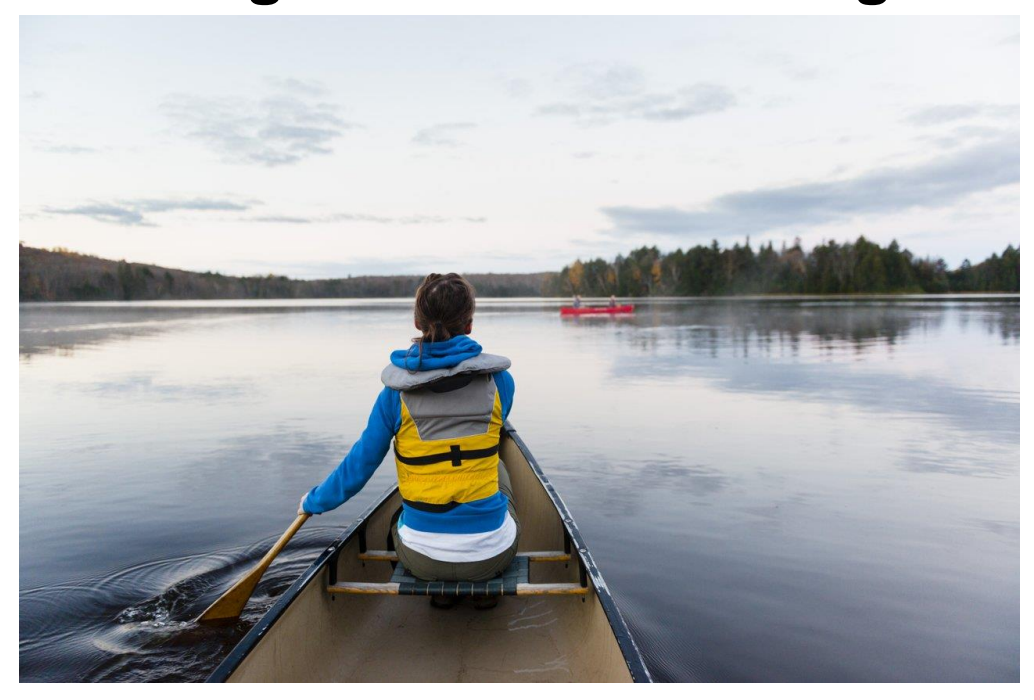
Leading the narrative change